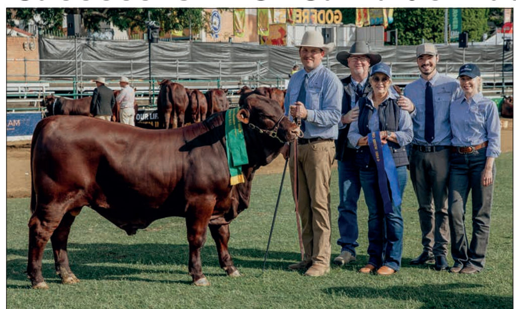
The NIOA Pastoral Co. team with NIOA VIP V70 (AI) (P) who took out his class (Junior Bull under 12 months) at Brisbane's Ekka - one of eight show ring ribbons for the Allora-based stud.