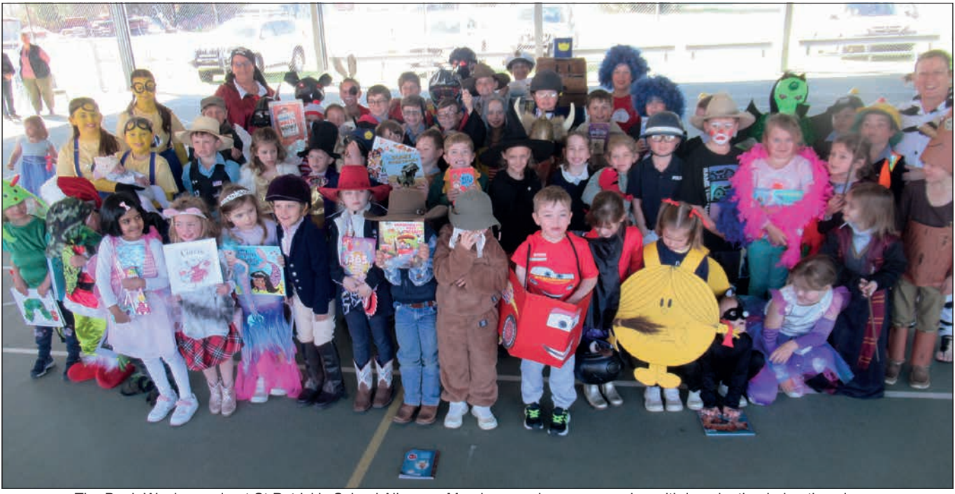
The Book Week parade at St Patrick's School Allora on Monday morning was amazing with imagination being the winner. Another special pic on page 5.