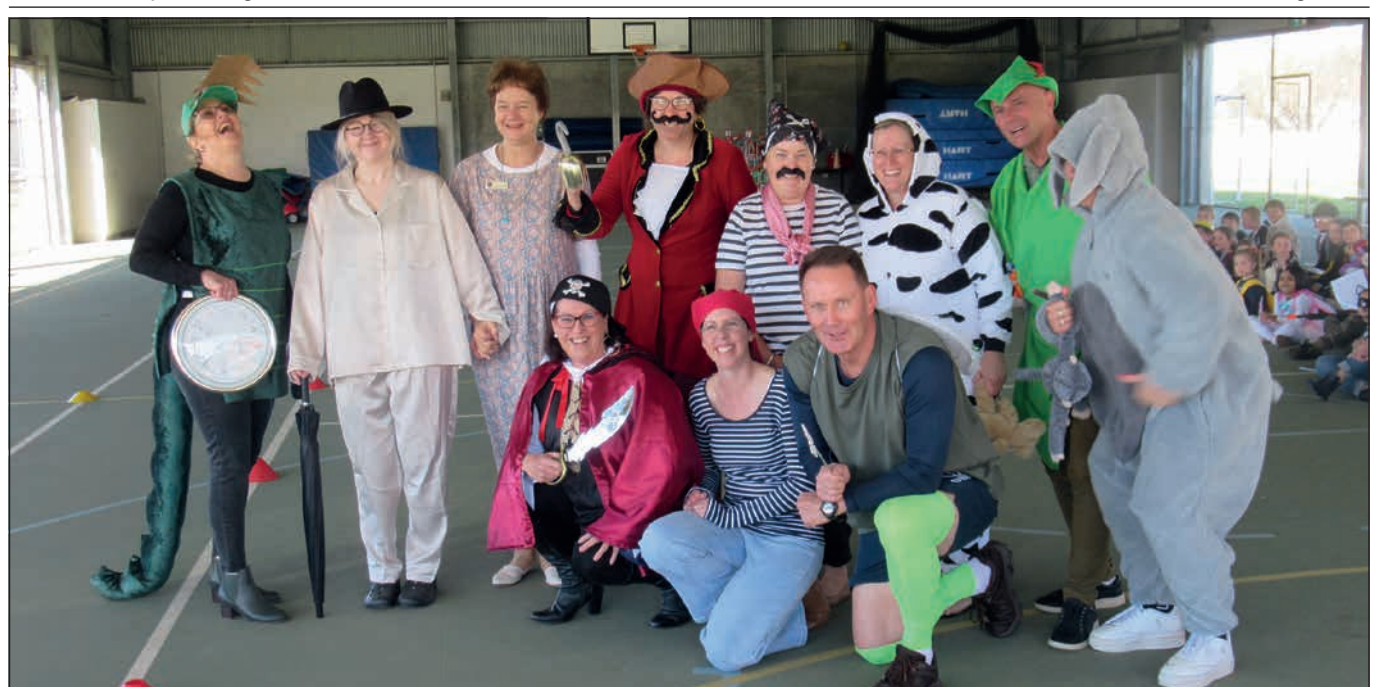
The Principal and Teachers at St Patrick's School dressed in hilarious costumes and then asked the kids to guess the book character they represented. A good audience of parents and friends enjoyed the light hearted entertainment